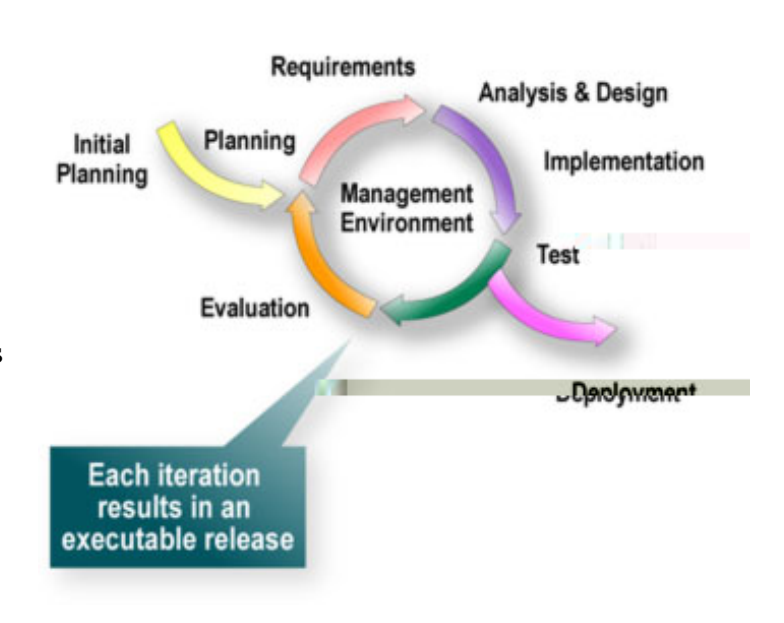
Figure 2: An Iterative Approach to Development

In this approach, built upon the work of Barry Boehm's spiral model (see "Further Reading"). the identification of risks to a project is forced early in the lifecycle, when it's possible to attack and react to them in a timely and efficient manner. This approach is one of continuous discovery, invention, and implementation, with each iteration forcing the development team to drive to closure the project's artifacts in a predictable and repeatable way.