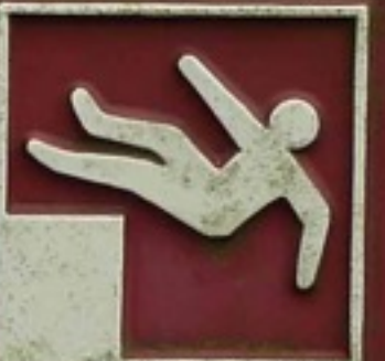
Dibynnau peryglus Unprotected drops

Lloriau anwastad neu lithrig Uneven or slippery surfaces