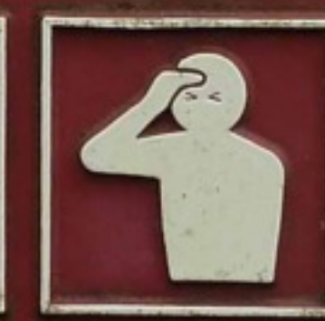
Rhowch gyfle i'ch llygaid ddod yn gyfarwydd â'r golau-mannau tywyll Please let your eycs adjust to the darkness