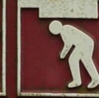
Toeau isel Low headroom